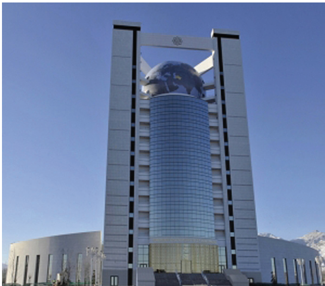
Turkmen foreign ministry

The new Turkmen foreign ministry built in Ashgabat includes a unique 26m diameter spherical conference room at its top which is decorated with a map of the world realised in mosaic tiles. Gurit has worked along with the main contractor, Bouygues International to deliver a composite design for this sphere complying with the challenging technical brief and the tight schedule.