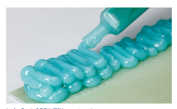
Left: Gurit SPRINT™ construction. Above: Spabond™ adhesive used for structural bonding

To further lightweight the hull structure, the Corecell™ M foam which formed the centre of the sandwich construction was thermoformed to the correct shape, considerably reducing resin uptake. Corecell™ M foam is a SAN structural foam core, well known for its unmatched toughness and impact resistance, making it the perfect choice for slamming areas such as hulls. To complement the use of Gurit SPRINT™ and Corecell™, a full range of Gurit epoxy resins and adhesive products were used for the fit out, including: Gurit mono component paste for bridging any gaps between the Corecell™ and SPRINT™ and creating seamless fillets, and Ampreg™ 31 Laminating system and Spabond™ structural adhesive for securing bulk heads in place and structural bonding.