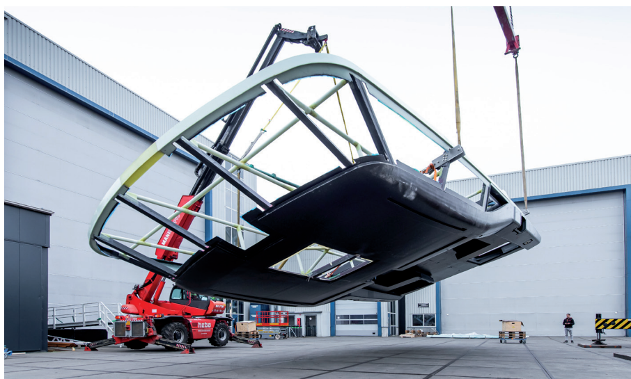
Deckhouse for Royal Huisman Project 405