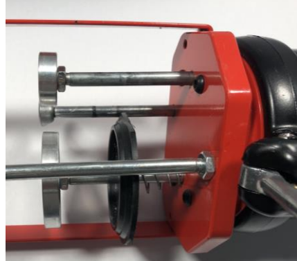
Figure 6 Figure 7

Now refit the Hardener plunger and screw on to align with the resin plunger. Once aligned lock the nut against the back of the plunger.