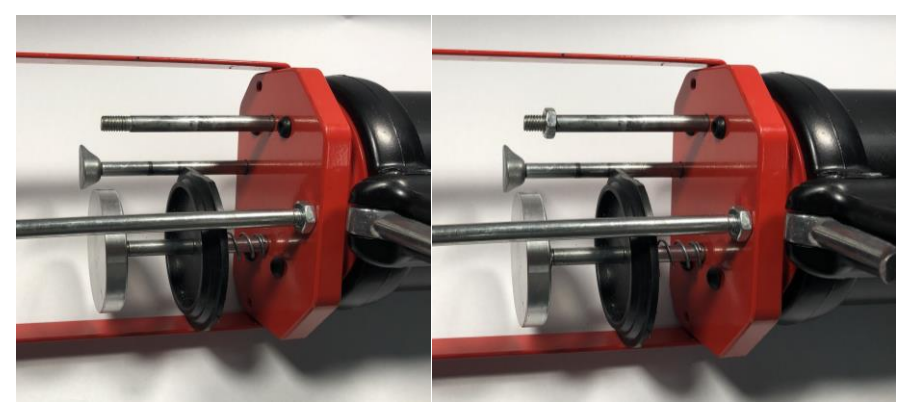
Figure 4 Figure 5

Loosen the hardener lock nut and remove the hardener plunger and also remove the cartridge support and spring.